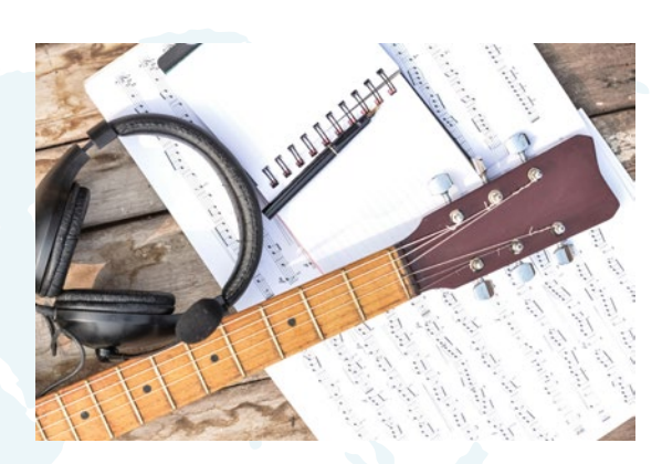
Communicate and present music as researchers, creators and performers.